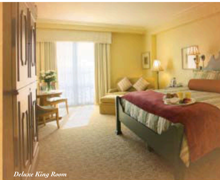
Deluxe King Room

Past visitors will notice a distinctive new look to the hotel's 750 guest rooms and suites. Authentic Italian furnishings and marble accents declare a European sensibility. Upgrade to the Portofino Club Level and enjoy exclusive amenities and access to the Portofino Club Lounge , featuring continental breakfast, evening hors d'oeuvres, beer and wine service, nightly desserts and more.