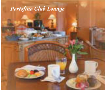
Portofino Club Lounge