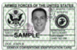
DD Form 2 (Reserve)

Disney SALUTES THE U.S. ARMED FORCES Walt Disney World Resort