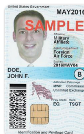
Common Access Card

Active Military Foreign Affiliate Eligible only with this ID (no other ID accepted)