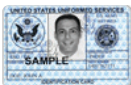
DD Form 2 (Retired)