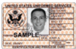
DD Form 1173

Retired Reserves Retired National Guard Eligible