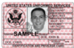
DD Form 1173-1