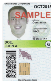
Common Access Card

Active Military Foreign Affiliate Eligible only with this ID (no other ID accepted)