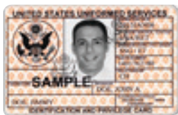
DD Form 2765

100% Disabled Veterans Medal of Honor Recipients Some Retirees Eligible