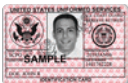
DD Form 2 (Reserve Retired)

Retired Reserves Retired National Guard Eligible