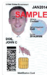
Common Access Card